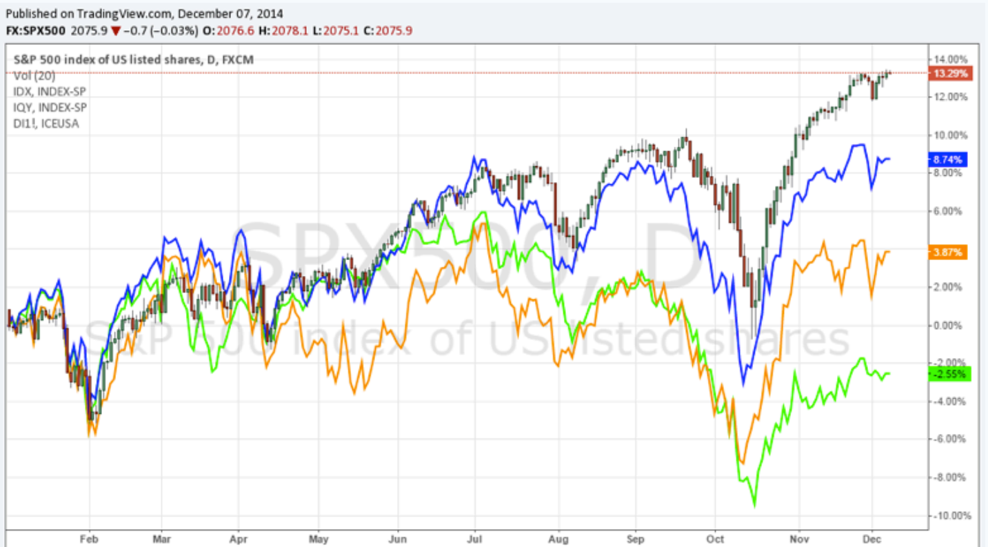
S&P 500 (red/black candle line) S&P 400 Mid cap (blue) S&P 600 Small cap (orange) MSCI EAFE (green)

Although the chart above ends on October 29th, the S&P 500 continued to gain even more strength after the global growth scare and Ebola sell-off, thus allowing it to close on December 5th at 2,075. Additionally, the following chart illustrates indices representing large cap, mid cap, small cap, and international stocks during 2014: